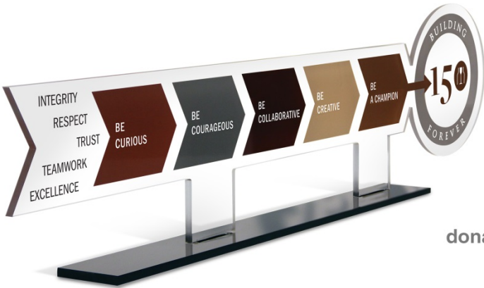
A large-scale acrylic sign, imprinted with the company's mission and goals, for prominent display in the client's public areas.