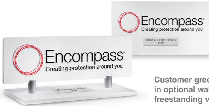
Customer greeting area sign, in optional wall-mounted or freestanding versions.