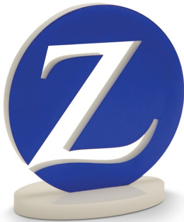
Countertop sign featuring a pierced cut-out of the client's logo.